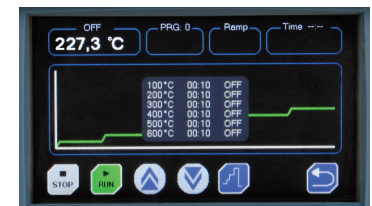
Temperature ramps graph